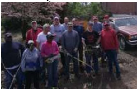
The Clean-up Crew

The Holy Spirit blessed our effort by removing the rain from the original forecast and providing a sunny afternoon for the BBQ.