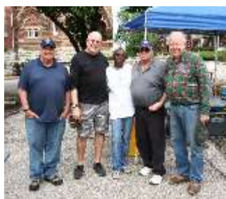
The BBQ Crew