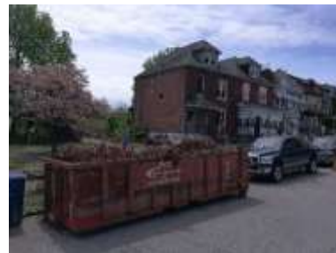
One of two full Dumpsters